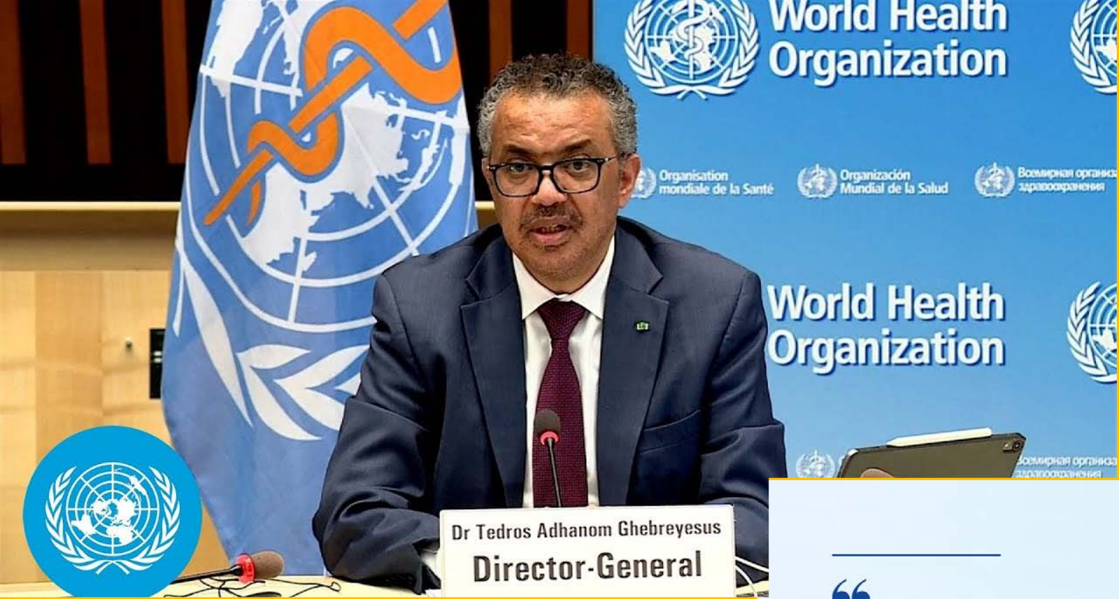
Dr Tedros Adhanom Ghebreyesus Director-General